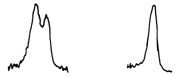
Fig. 3.—Double resonance experiment on IV. Before irradiation of the bridgehead proton the cyclobutene proton appears as a doublet (J = 0.86 c.p.s.). After irradiation of the bridgehead proton the doublet collapses to a singlet.

fate. Filtration and concentration (in vacuo) gave a colorless viscous oil which was treated with ethanol (1.0 inl.) and evaporated again (to remove chloroform). The crude product gave a positive periodic acid test. Colorless platelets were obtained by rystallization from aqueous ethanol or aqueous acetone; m.p. 229–231°, \lambda_{\rm max}^{\rm S8\%~EtoH} 220 m \mu ( \epsilon 25,000), \lambda_{\rm max}^{\rm S8\%~FtoH} 265 m \mu ( \epsilon 15, 200), \lambda_{\rm max}^{\rm CHO13} 5.71 and 6.00 \mu .